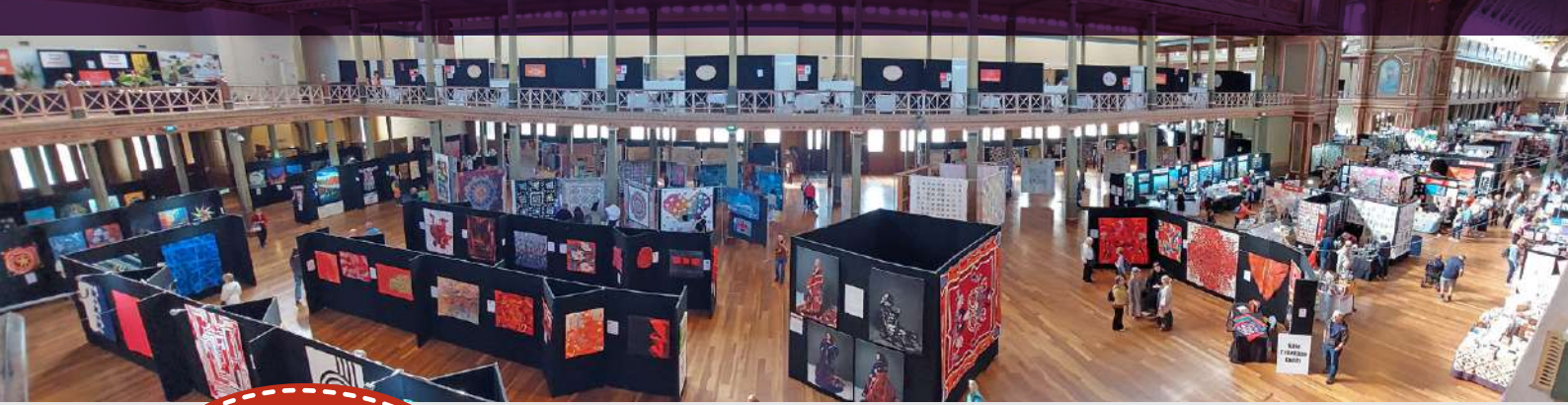
Exhibit at the Australasian Quilt Convention 2026!